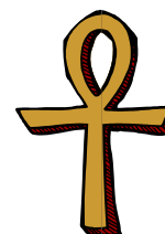
Ankh — Life

tombs, and is simply, "life", "eternal life" or even "give life". And we like the way it looks.