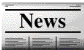
Local newspapers contain anything but

We find it to be a shame when news agencies go astray, almost like they forget how to do actual reporting of news and think solely about making more money.