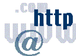
How to link to us

Anyone wishing to have their website linked by ours — we recommend that you visit Everywhere's Local, and post your business in the services directory — it's free.