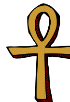
Ankh — Life

tombs, and is simply, "life", "eternal life" or even "give life". And we like the way it looks.