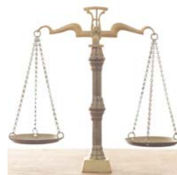
Equal treatment for all members

ramps, or even a business that's on the verge of going under. Alcove members should vow to help out the community whenever possible.