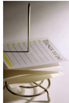
Online business directory

There will be some overlap with chambers, tourism boards, even developmental agencies to an extent. But that